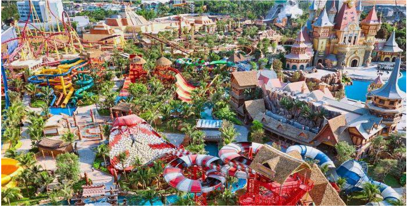
Overnight in Phu Quoc